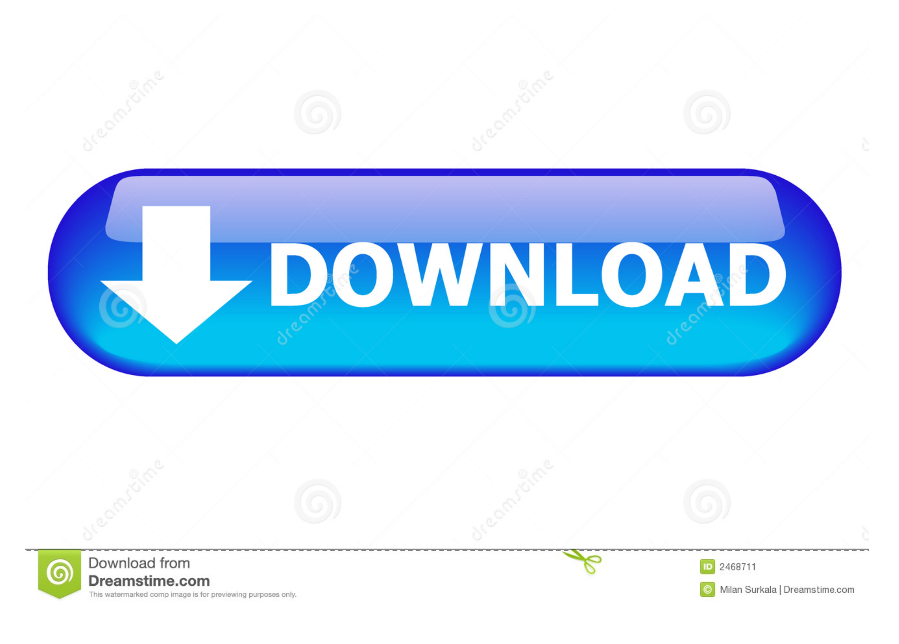
Flippingbook Publisher Professional 2228 Crack